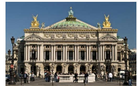
Place de l'Opéra Garnier