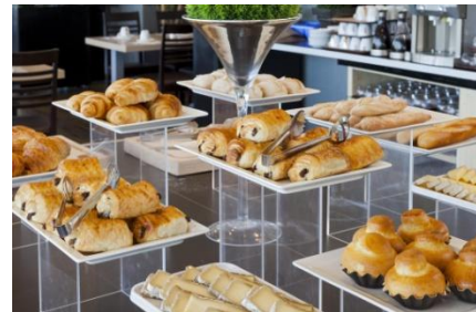
Hotel Mercure Paris 19 Philharmonie La Villette