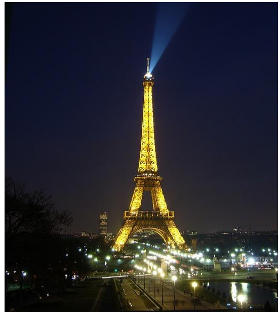
Paris evening city view