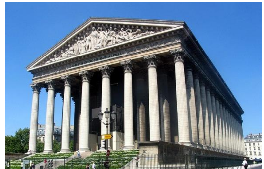
L'église de la Madeleine