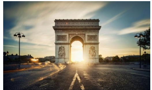
Arc de Triomphe de l'Etoile