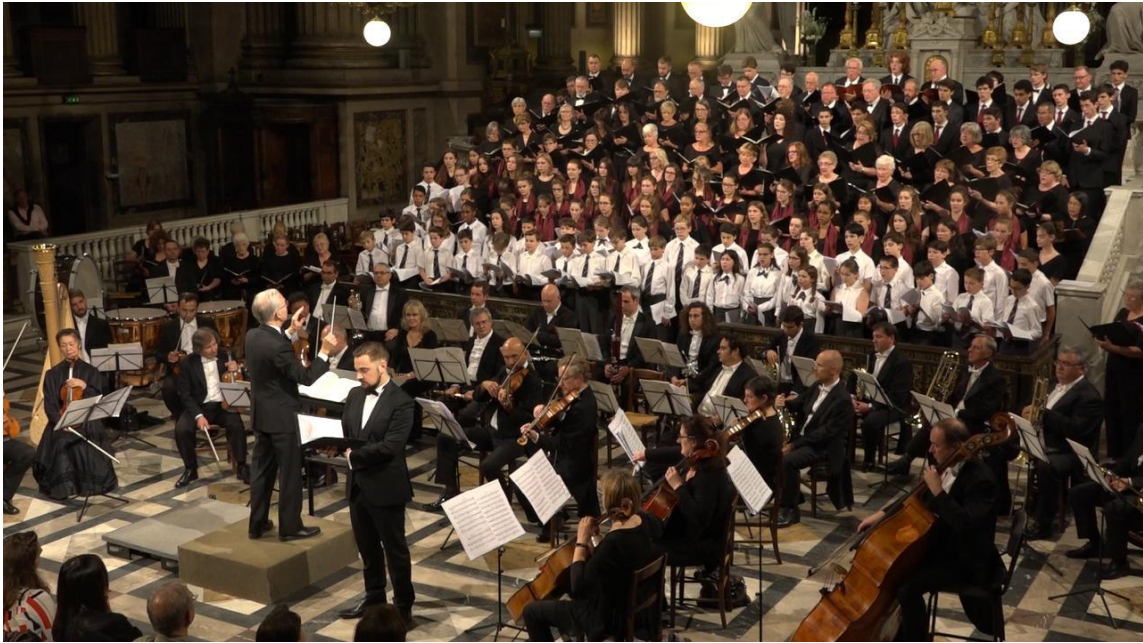
American and French choral artists perform Fauré's Requiem in La Madeleine in Paris on June 12, 2018, conducted by Earl Rivers